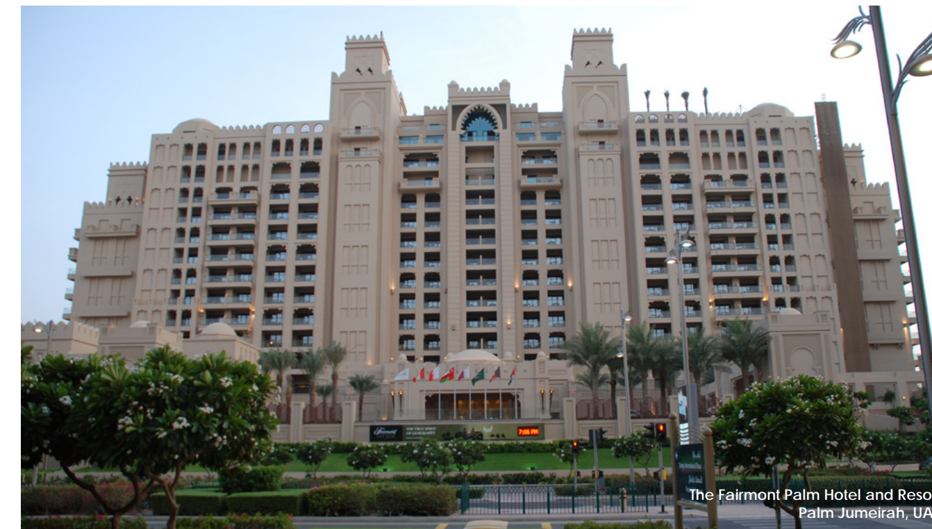
The Fairmont Palm Hotel and Resort Palm Jumeirah, UAE