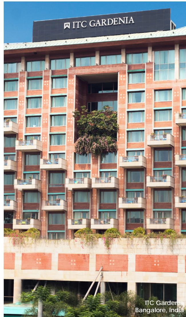
ITC Gardenia Bangalore, India