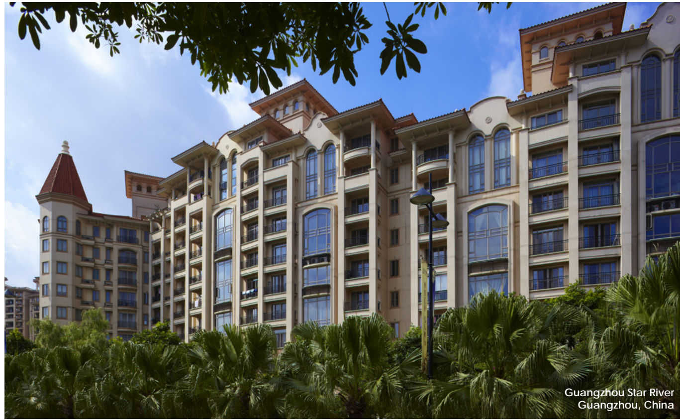
Guangzhou Star River Guangzhou, China