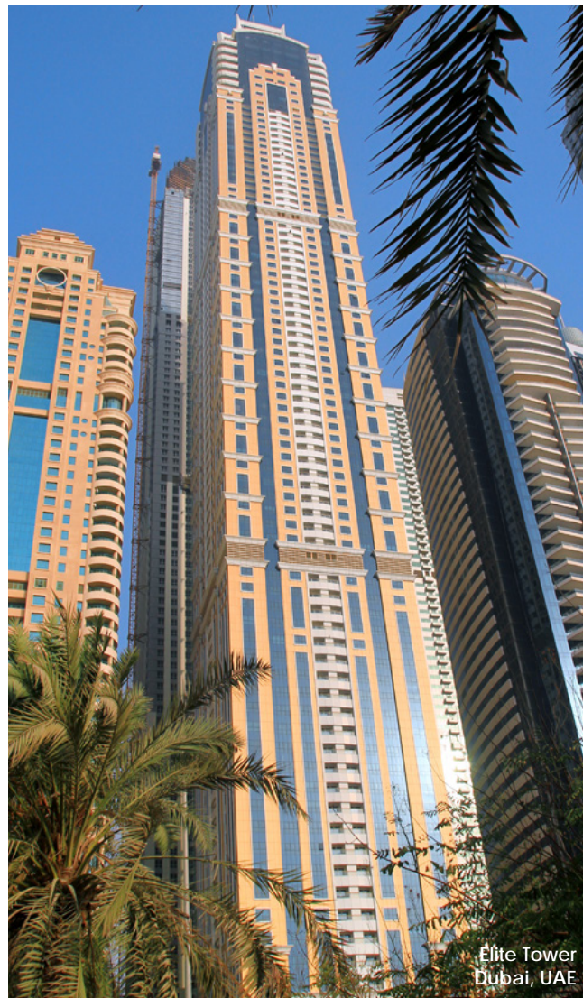
Elite Tower Dubai, UAE